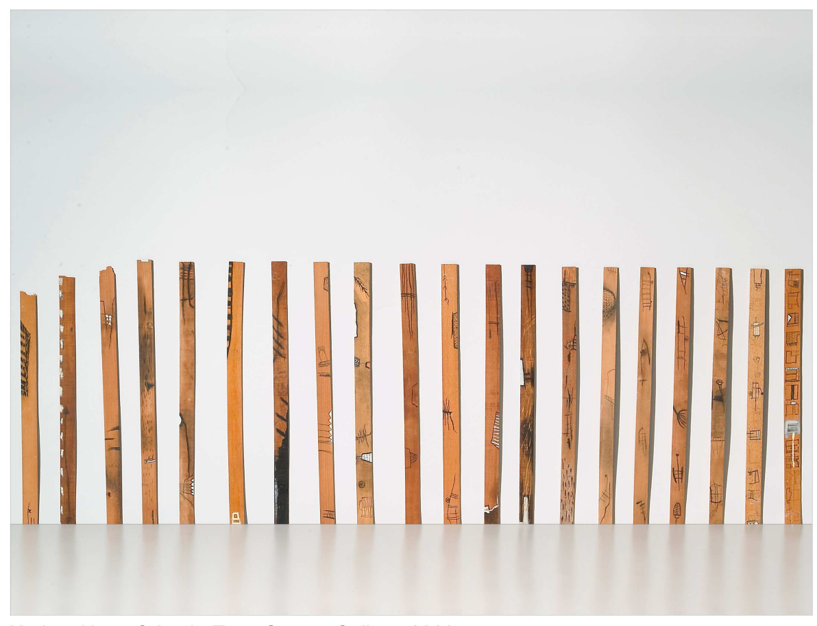
Hedge, Nona Orbach. Tova Osman Gallery, 2003

The exhibition " Hedge " at the Tova Osman Gallery is a sequel to Nona Orbach's " Tel Nona " held at the National Maritime Museum in Haifa. This exhibition is a trilogy, the three parts of which are complementary. One part is composed of drawings on paper that are included in the series " 1000 drawings ". Using pencils and oil chalks on little square pieces of paper, the artist has sketched a collection of suggested images: a cypress tree, a leaf, a wheel, a table and a fish – all of them simulating torso representations. The next part, on an adjacent wall, shows narrow wooden strips hanging on a hedge. The third part is an element borrowed from the series " Large remains " to be